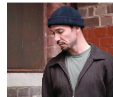
Social determinants of health

We work to improve the health and well-being of the communities we serve by identifying and addressing our community's most pressing health concerns. Today, those priorities are addressing the social determinants of health; improving access to mental health services and addressing substance abuse; promoting healthy eating and active living; and improving air and water quality.