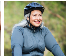
Healthy eating & active living