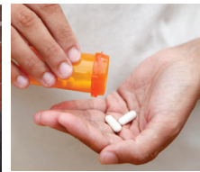
Mental health & substance use