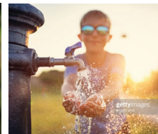
Air & water quality

Knowing that we are stronger by working together, we partner with community organizations on specific strategies that target the top four health challenges facing Lancaster County. We strive to influence health where people live, work, play and learn.